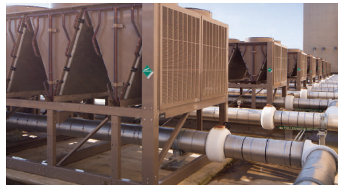
Closed-loop glycol only requires replacement every five years and there are no filters to change.

The YVAA from YORK® is designed to provide the best overall life-cycle costs through efficient performance, remarkable flexibility and optimized reliability. Closed-loop glycol only requires replacement every five years and there are no filters to change. These design features, along with easy access to service components, provide a low cost of ownership. And with features and options that ensure an optimized chiller and years of worry-free operation, the YVAA provides greater reliability and real-world efficiency.